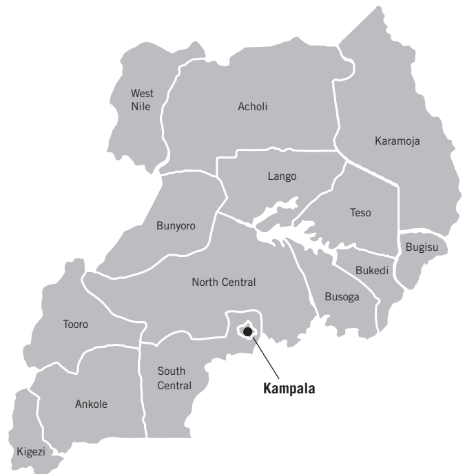
FIGURE 1 MAP OF UGANDA

Uganda has been relatively peaceful and stable in the recent past, although the country has experienced multiple rebellions in the north of the country, including most notably the violent and terrorizing presence of the Lord's Resistance Army between 1987 and 2006 (Souaré 2009; HRW 2012). The Democracy Index classifies Uganda as a "hybrid regime," with substantial irregularities in elections preventing them from being considered free and fair (EIU 2018).